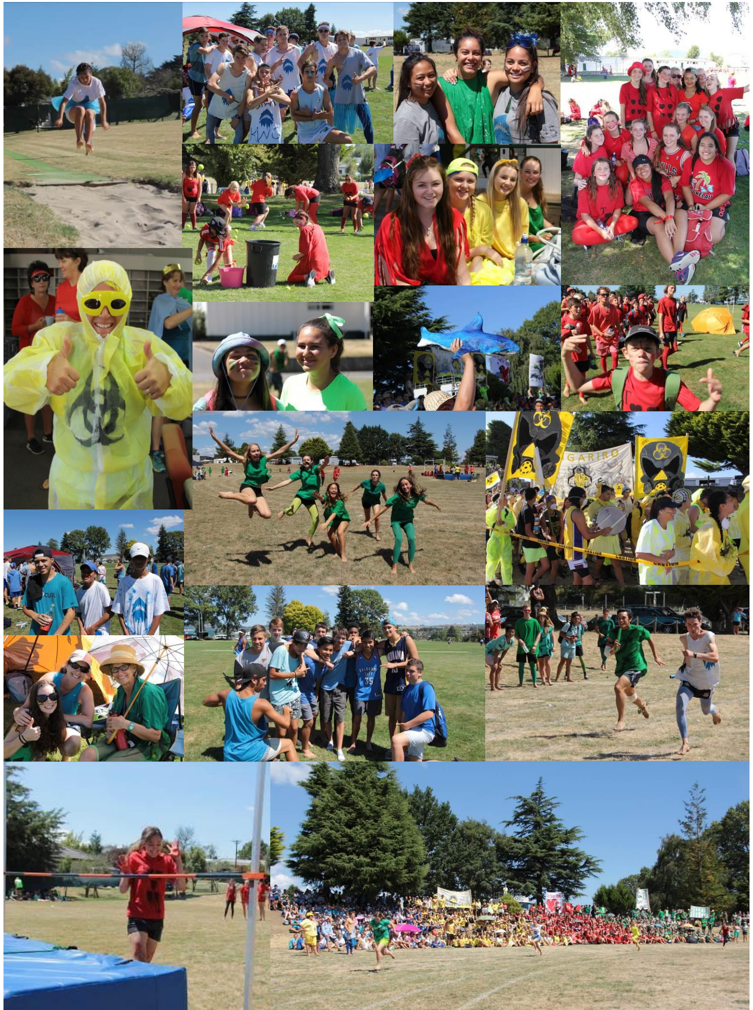
Colours Day 2015