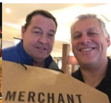
All Blacks jersey signed last week by the 2016 All Black team.